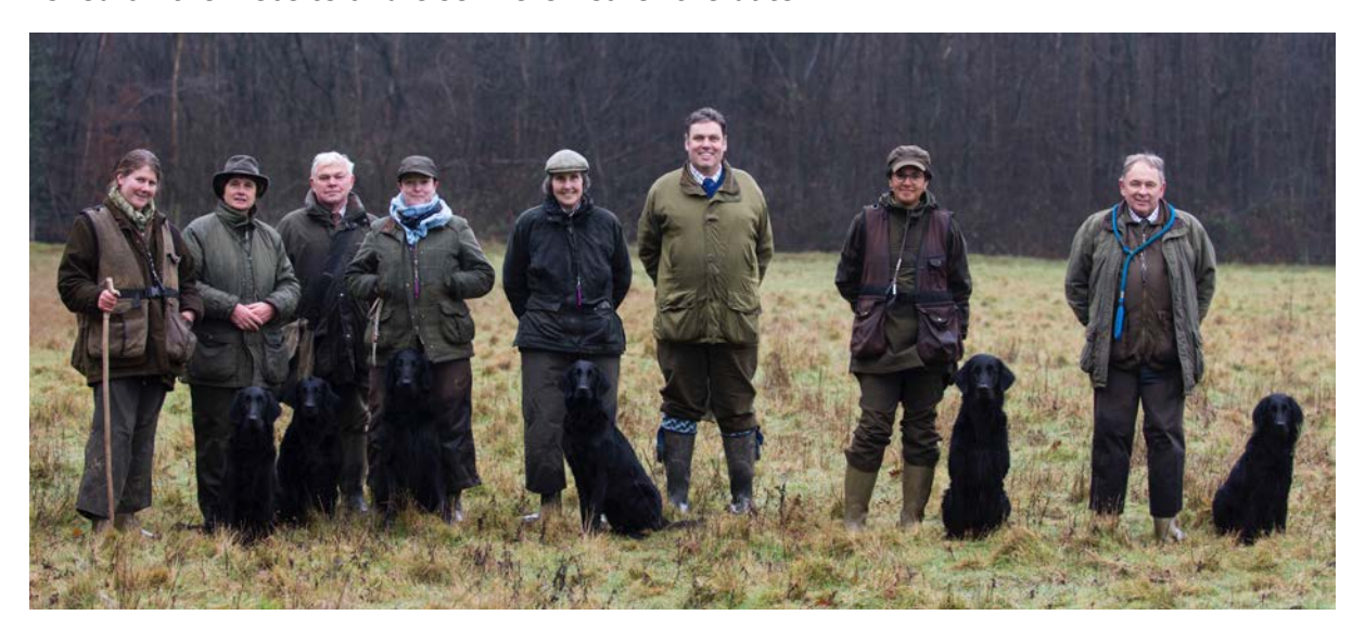
Five SDC passes were achieved, with two "A"s and 3 "B"s. Unfortunately, there was one fail on this occasion.

We have been told we can have a day in November next year, and details will be published on the website and elsewhere nearer the date.