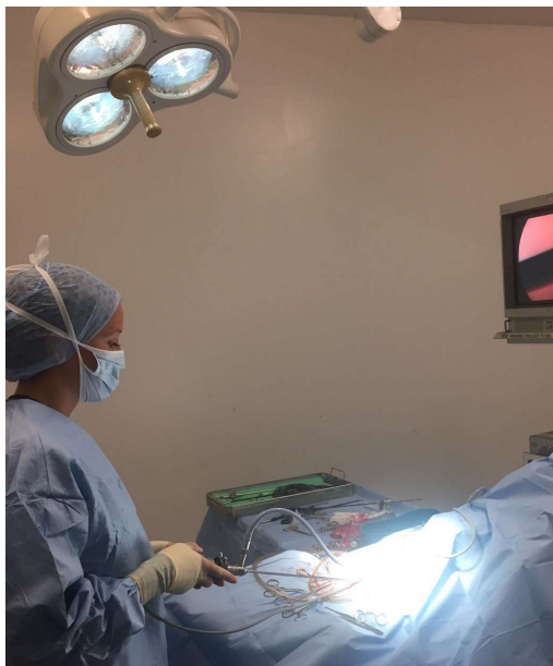
Figure 3: A LAG being performed at Davies Veterinary Specialists in Hertfordshire

The prognosis for dogs that have had a prophylactic gastropexy is excellent. It is worth noting that there are no studies documenting the long-term outcome of this procedure however there has never been a report of GDV in a dog that has received a prophylactic gastropexy.