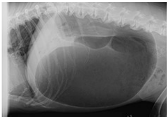
Figure 2. A radiograph (x-ray) of a dog with a GDV : note how the stomach is markedly distended with gas (black on the radiograph) and fills almost the entire abdomen

Your vet may be able to diagnose GDV just by examining your dog. When the stomach twists and dilates it can distend the whole abdomen. This can be seen or felt from the outside, the abdomen will distend and the stomach makes a drum like noise ('tympany') when it is tapped ('ballotted') whilst listening with a stethoscope. Typically signs of shock are seen including a weak rapid pulse, pale gums and a fast breathing rate. Diagnosis is usually confirmed by X-ray (see figure 2).